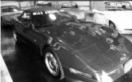
Above: Miss America 1993 Convertible - 40th Anniversary Car in Ruby Red. Formerly owned by Leanza Cornett - Miss America 1993