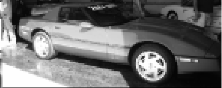
Zora Arkus Duntov's last personal Corvette