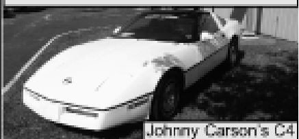
Johnny Carson's C4