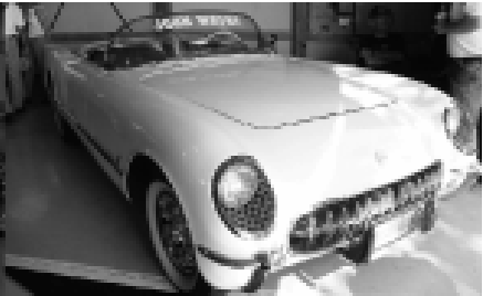
Above: John Wayne's (The Duke) 1954 Polo White Convertible. There were 3,640 produced that year.