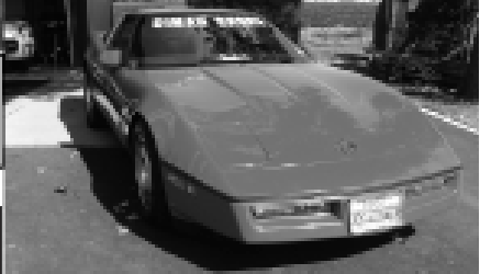
Dinah Shore's 1987 Corvette

Chevrolet introduced a special 40th Anniversary Edition Corvette in the 1993 model year. At the time, Corvette had recently celebrated an additional milestone: The one-millionth Corvette built on July 2, 1992. The 40th Anniversary package, available on all '93 models, included an exclusive Ruby Red exterior and interior, color-keyed wheel centers, headrest embroidery, and emblems on the hood, deck and side-gills.