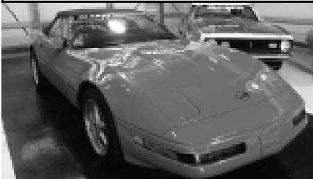
Mario Andretti's Corvette