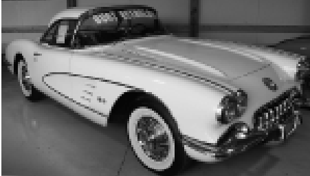
Burt Reynolds 1960