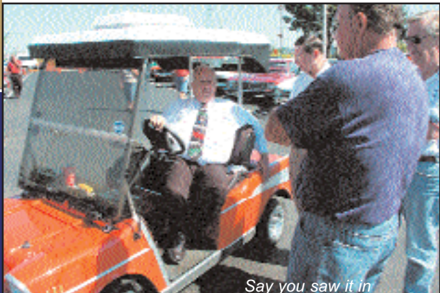
Say you saw it in

classes, which allow all kinds of Corvettes to compete, and compete fairly. Whether you have a fanatically prepared and