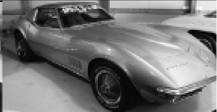
Above: Jim Lovell, Apollo 13 Astronaut's Car