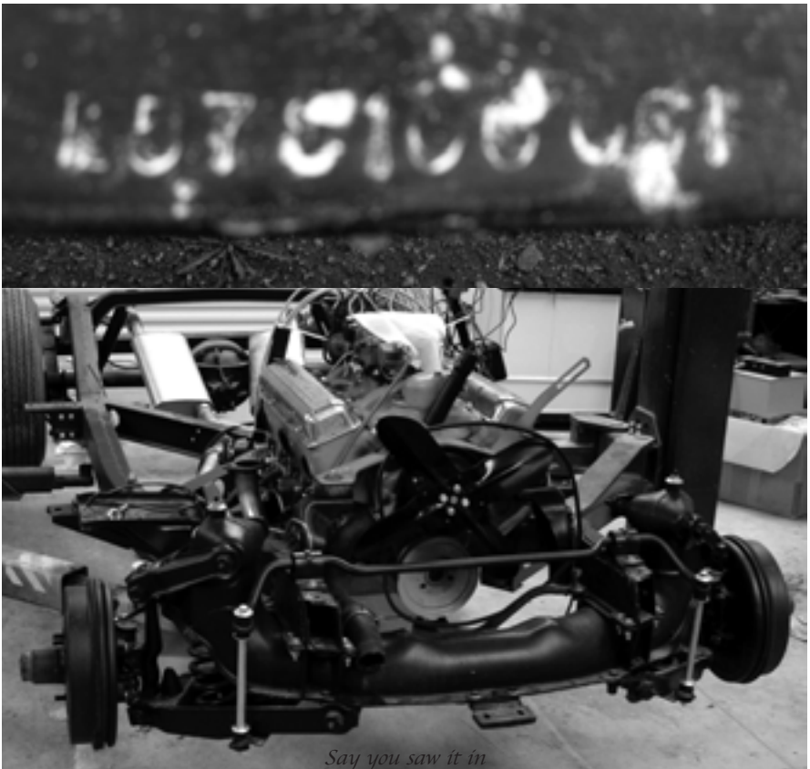
Say you saw it in

Restoring the 1956 Corvette VIN #001 as "numbers matching" should be very straight forward. The 1956 Corvette production run at St. Louis did not start until mid January 1956 so finding parts with correct dates is doable. For example find a 3720991 engine block cast prior to January is not difficult because it went into production for Chevy passenger cars back in August 1956.